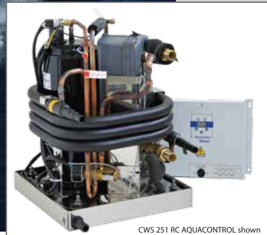
CWS 251 RC AQUACONTROL shown