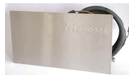
Serie F inox